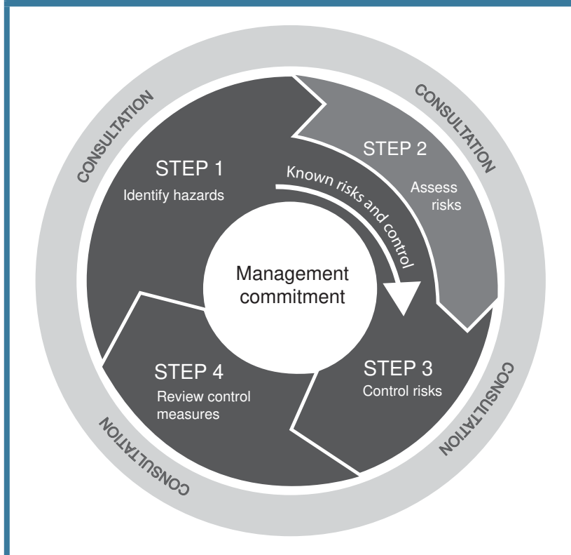
FIGURE 1: The risk management process

Many hazards and their associated risks are well known and have well established and accepted control measures. In these situations, the second step to formally assess the risk is unnecessary. If, after identifying a hazard, you already know the risk and how to control it effectively, you may simply implement the controls.