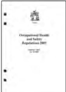
Occupational Health and Safety Regulations 2007

The Occupational Health and Safety Act 2004 (the OHS Act) sets out the key principles, duties and rights in relation to occupational health and safety (OHS).