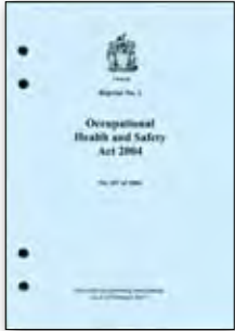
Occupational Health and Safety Act 2004