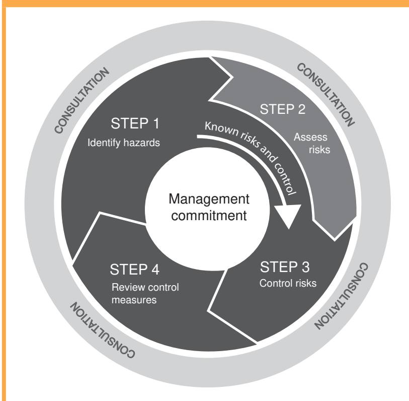
FIGURE 1: The risk management process.

Many hazards and their associated risks are well known and have well established and accepted control measures. In these situations, the second step to formally assess the risk is unnecessary. If, after identifying a hazard, you already know the risk and how to control it effectively, you may simply implement the controls.